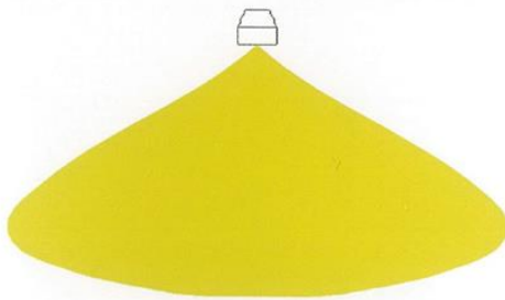
120 Degree beam angle